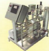
THE MOST CONVENIENT AUTOMATIC PASTEURISER Fully automatic pasteuriser