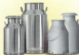
KK SS & ALUMINUM MILKCANS Available in 5 to 50 Ltrs.