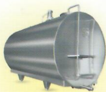
MILK COOLING TANK CLOSED TYPE Available in 2000 to 15000 Ltrs.