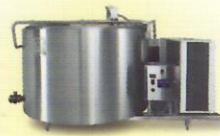
MILK COOLING TANK OPEN TYPE Available in 100 to 2500 Ltrs.